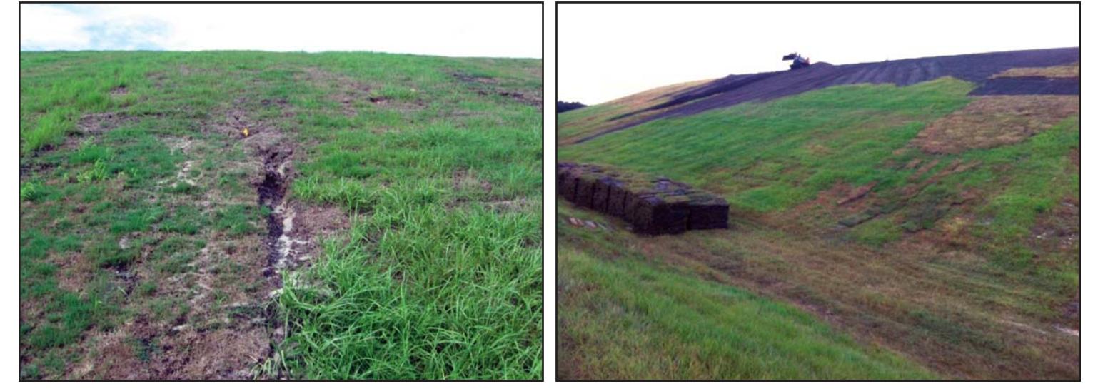
Figure 3. Erosion