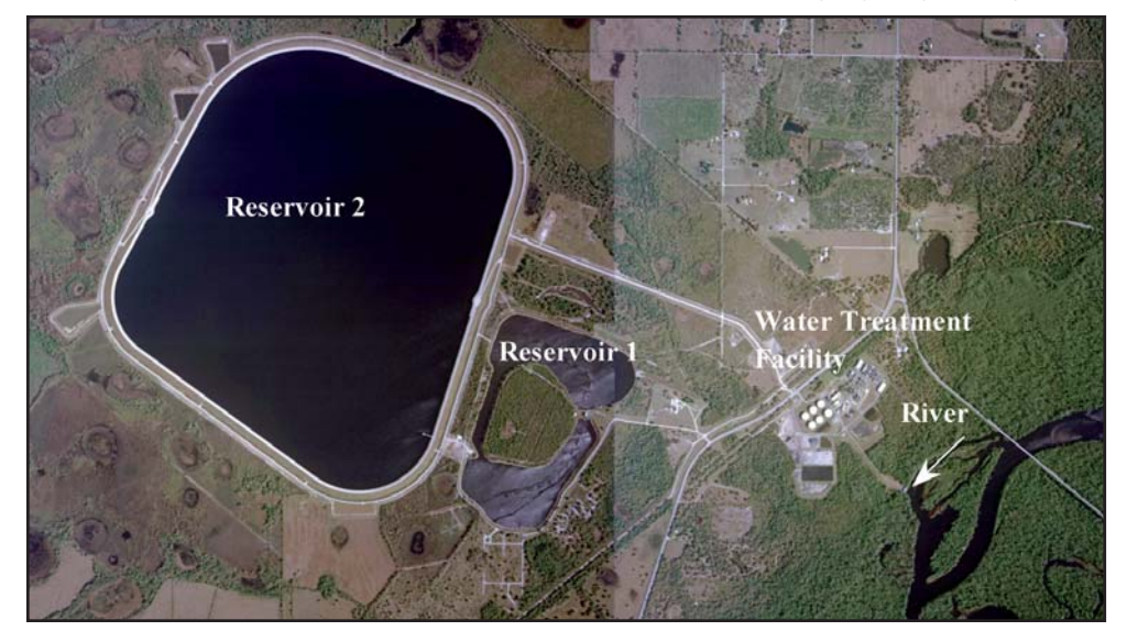
Figure 1. Two Off-Stream Raw Water Reservoirs

Figure 2 shows the cross section of the Reservoir 2 berm, highlighting the engineered