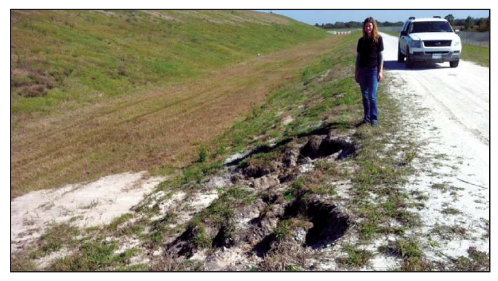
Figure 5. Interior Slope Washout